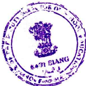
Principal Sainik School East Siang Arunachal Pradesh (Signature of Principal)

Dy. Director of School Education (Signature of D.E.O.) East Siang Distt. Pasighat